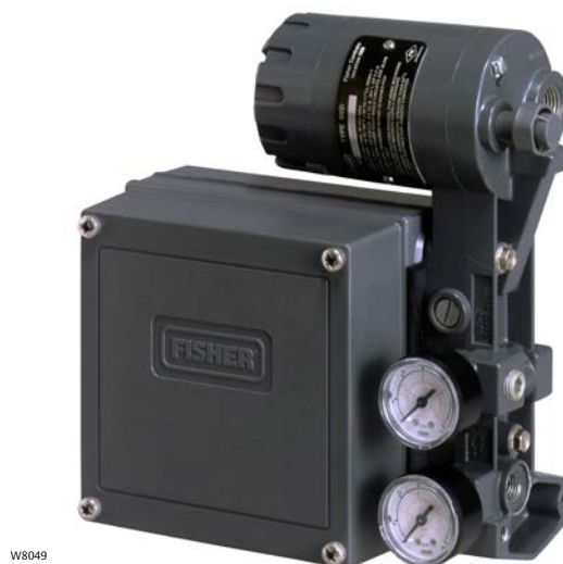
Figure 4. Fisher Instrument with Standard Finish

Comparisons of paints other than standard have shown no advantages in using other paints. Because of the potential impact on instrument performance, we are unable to apply coatings or paints other than our standard.