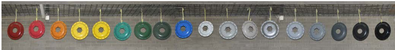
Figure 2. Any Color of Powder Coating Can Be Specified; A Sampling of Available Colors are Shown on Actuator Casings