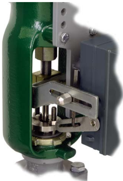
Figure 7. Heavy Zinc Plating Specifications

For hardware items such as instrument feedback arms and stem connectors, heavy zinc plating is standard. Heavy zinc plating is used for non-threaded parts that require protection from corrosion.