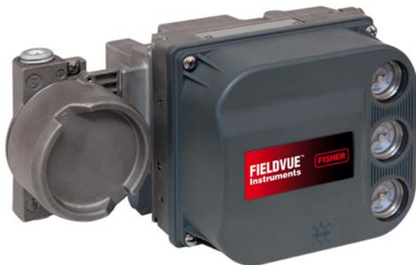
Figure 5. Fisher DVC6200 Digital Valve Controller Stainless Steel Version

As an alternative to painted instruments, the FIELDVUE™ DVC6200 digital valve controller can be furnished with a stainless steel module base, housing and an all-stainless mounting kit. The sealed terminal box isolates field wiring connections from other areas of the instrument and keeps water and harsh atmosphere away from electronic components. The DVC6200 stainless steel version eliminates all diecast aluminum parts, which greatly increases its resistance to the tough, corrosive environments found on offshore platforms, within chemical plants, and inside refinery processing units.