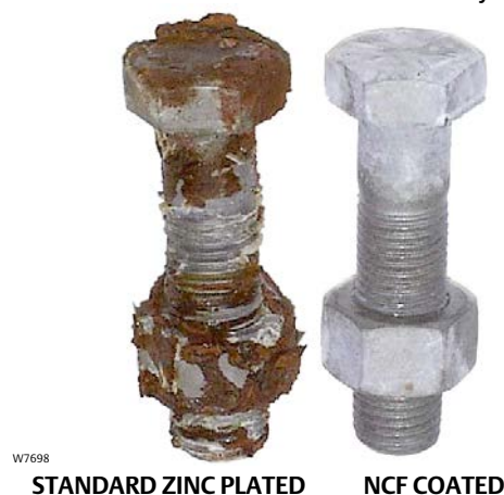
Figure 6. NCF-Coated Fasteners Exhibit Superior Performance in Accelerated Laboratory Tests

The effectiveness of this proprietary coating designed specifically for the control valve market has been proven by actual testing on offshore platforms and accelerated salt-spray tests in the laboratory. NCF coated fasteners remain easily maintainable after offshore exposure. Original replacement NCF bolting is only available from Emerson Automation Solutions.