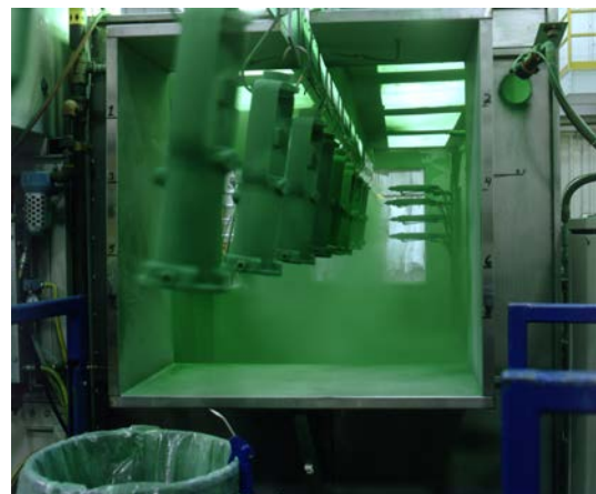
Figure 1. Powder Coating is Nearly 100% Free of VOCs