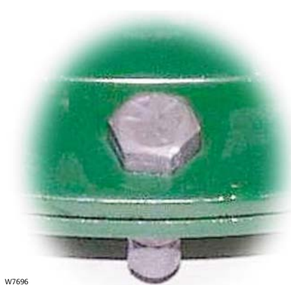
Powder-Coated Actuator Casings with NCF Coated Cap Screws after 500 Hours in an Accelerated Salt Spray Laboratory Test